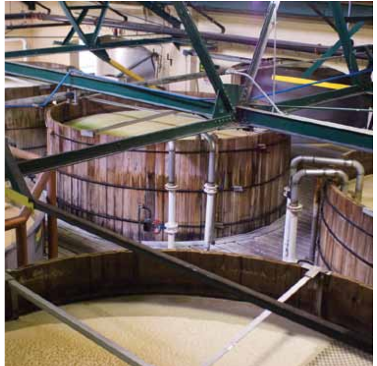
Cypers fermenters holding the distillers beer as they ferment and convert sugar to alcohol to generate various flavors and aromas found in the finished product

Operators monitor and control the distillery process from one central control room and two workstations located at different levels of the facility. “The screens at each workstation are the same as before the APACS+ DP I/O Bus Link installation,” Ashley says.