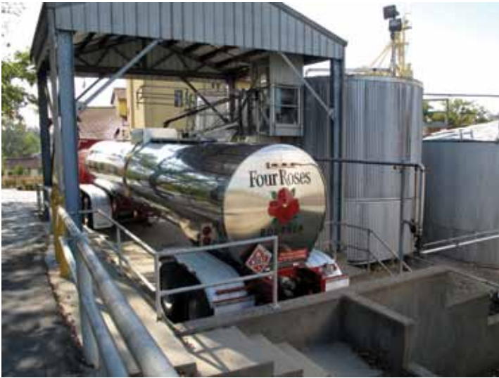
Tanker truck used to haul Bourbon distillate to the barrel warehouse and aging facility

"The system worked perfectly before and it works perfectly now," Ashley continues. "But today, we have the latest and greatest supported software. I don't anticipate that changing."