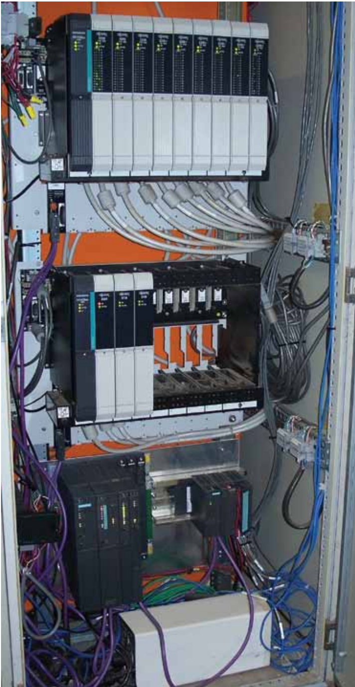
APACS+ I/O racks with DP/I/O Bus link modules connected to a PCS 7 controller installed at Four Roses

Four Roses now has the enhanced process control capabilities of the PCS 7 DCS, including the flexibility and added capacity of multiple scan rates (up to 10 milliseconds). The modernization also provides higher fault tolerance, flexible modular redundancy, higher safety (SIL 3 independent of redundancy), integrated asset management, integrated safety fieldbus, and integrated Ethernet.