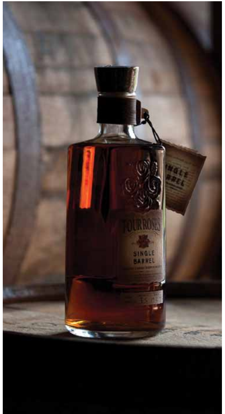
Bottle of a single barrel bourbon resting atop a barrel in the barrel warehouse

De-mineralized water is manually added to the distillate reducing the proof to 120. The distillate is then poured into charred oak barrels where it will remain for the next five to 20 years, depending on the final product.