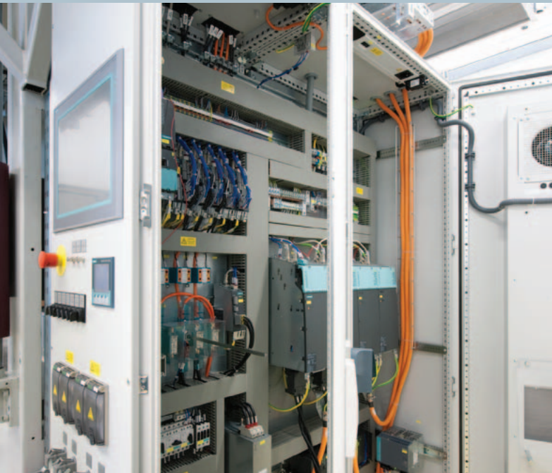
Prefabricated control cabinet from Siemens