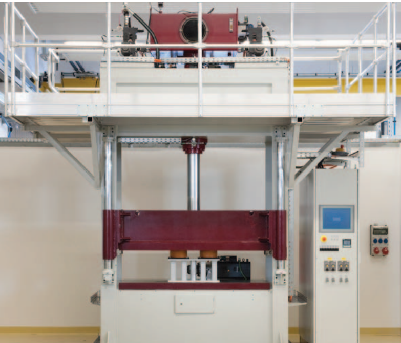
"PSH", the new servo-hydraulic press in an endurance test in Rutesheim

As a result of resources that are becoming scarcer and scarcer, the topic of energy efficiency is also becoming more important for the machine building industry. The new servo-hydraulic "PSH" press from Voith is an important step in this direction, allowing energy consumption to be slashed by up to 60% – for new systems as well as retrofits.