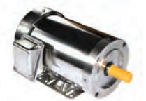
GW Electric stainless-steel motor

GW Electric (Shanghai) Co. Ltd. is a motor manufacturer established in 1952 and formerly known as SMM, JLM, and Shanghai Regal-Beloit & Jinling Co. Ltd. (a joint-venture with Regal-Beloit since 2002). In 2014 the company became part of the GW Industrial Group Co. Ltd. The company will be showcasing its d-c motors and fractional-horsepower a-c motors , including single-phase and three-phase motors designed to NEMA and IEC standards. The company provides after-sales and technical consulting services for its customers and owns a UL- and CSA-approved laboratory with certification facilities for testing.