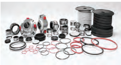
A selection of Vulcan Seals' products

Vulcan Seals, Inc., which offers "a global distribution network and total commitment to excellence in service, quality, and value," will feature the sealing products it manufactures: mechanical seals, FEP/PFA encapsulated O-rings, and mechanical packing.