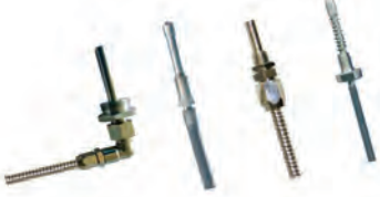
Dandong Keliang bearing temperature sensors

Dandong Keliang Electron Co. Ltd., a supplier of motor accessories , will feature its thermistors, sensors, encoders, heater tapes, thermo switches, and motor protectors. Keliang is a 16-year-old company whose products are used worldwide by such companies as ABB, Siemens, Nord, and TECO. Its products are certified by UL, ATEX, IEC, and CE.