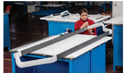
Coil Partners' coil manufacturing

Coil Partners, whose operations were described in a feature-length article in the October 2016 Electrical Apparatus , will be displaying its many types of high-voltage and medium-voltage coils , which include d-c coils, a-c coils, diamond coils, pole coils, Roebel bars, and hairpin coils.