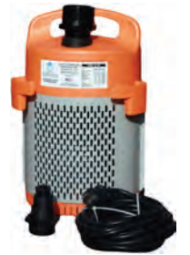
Precision Electric pump

Precision Electric Motor Sales, which represents Marathon, Fasco, US Motors, Century, and Rotom, will be featuring the Site Drainer Pump with a physical demonstration that shows the pump's ability to drain debris-filled water without clogging. Precision Electric Motor Sales offers one-day delivery to most of the U.S., according to the company.