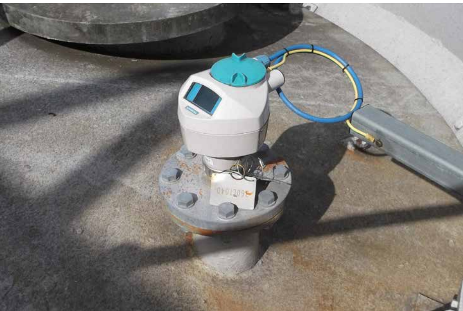
Installing the SITRANS LR250 was easy and PPG now has reliable, high-performance continuous level measurements on their process vessel.