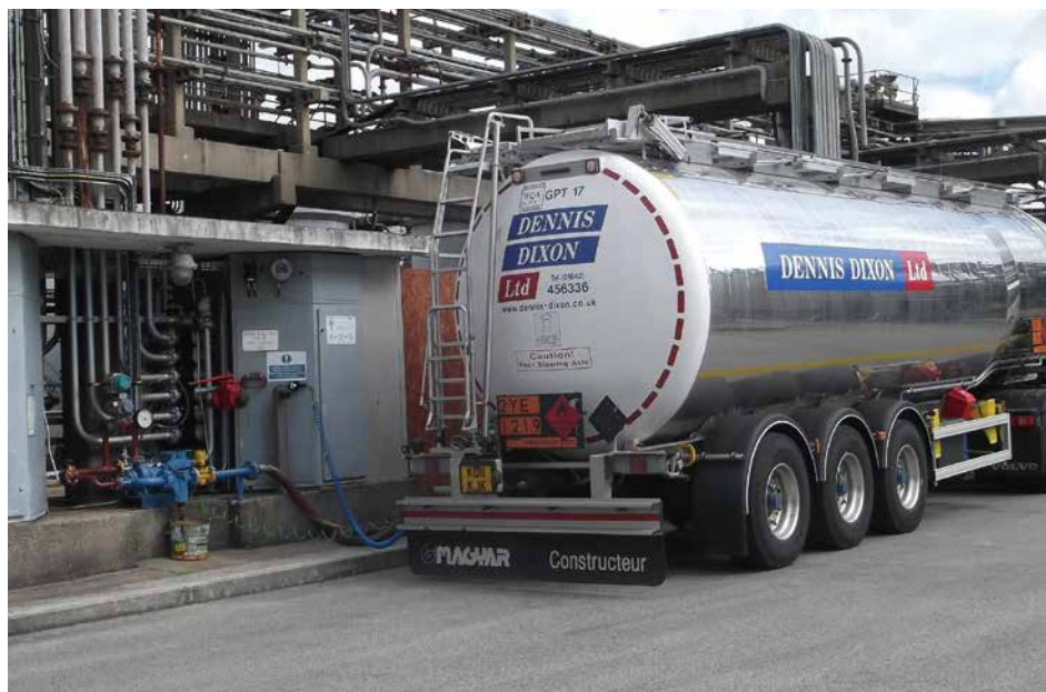
The new system is designed so that when one tank is being pumped, all tanks are monitored simultaneously to make sure that there are no leaks.