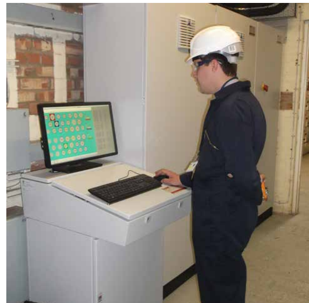
Part of the new HSE legislation requires operators to supervise all pumping activities in real time.