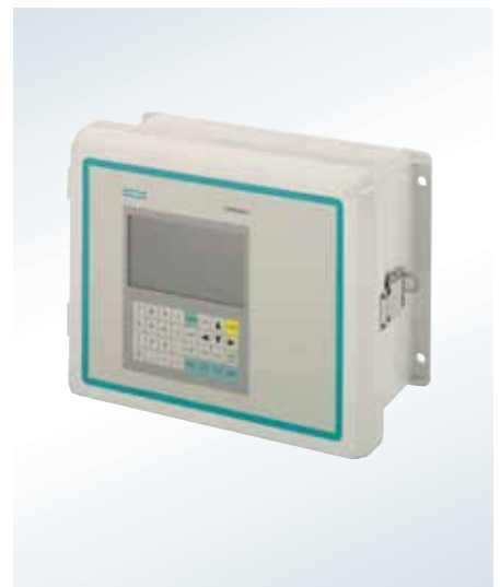
SITRANS FUS1010 clamp-on transmitter

The customer had been using insertion-type, hot-tap magnetic flowmeters from another manufacturer. Due to the placement of the insertion meters (at least one in a downward flow condition), the meters were only lasting from 8 to 12 months and then required replacement at approximately $5000 each.