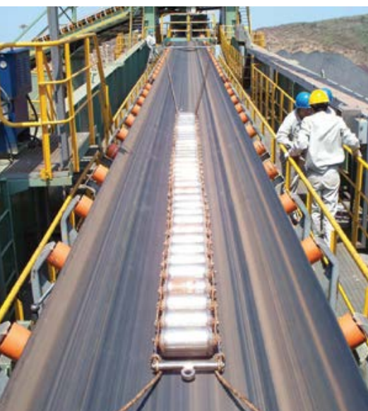
Test chain calibration is widely accepted method of belt scale calibration that may offer advantages in some applications.

Coal then moves onto a conveyor and is carried on a belt to the stockyard, where a stacker-reclaimer creates mountainous stockpiles of the black rock. Conveyor belts equipped with belt scales then carry the material into storage bunkers, where coal awaits the furnace.