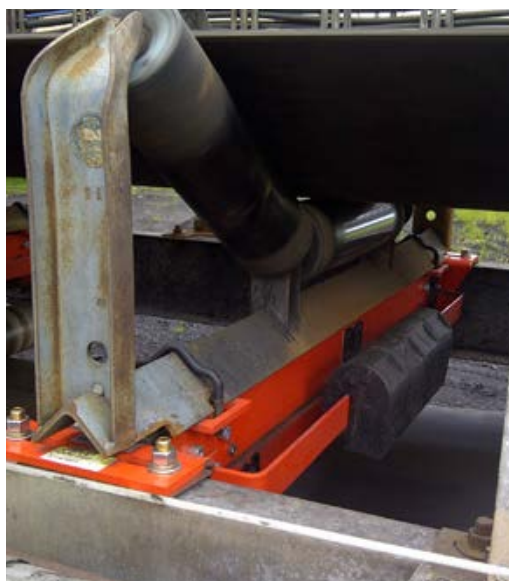
Static test weights are the most popular and cost-effective means of belt scale calibration.