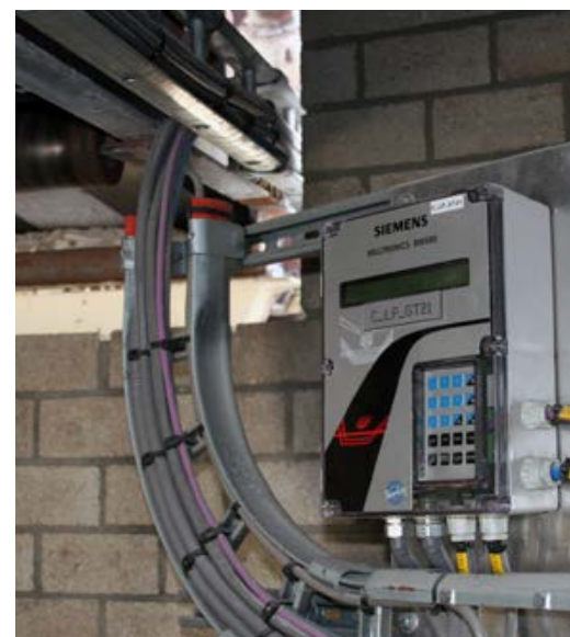
Electronic calibration has become a friendly alternative to processes that are not able to stop the conveyor and perform a normal span calibration.