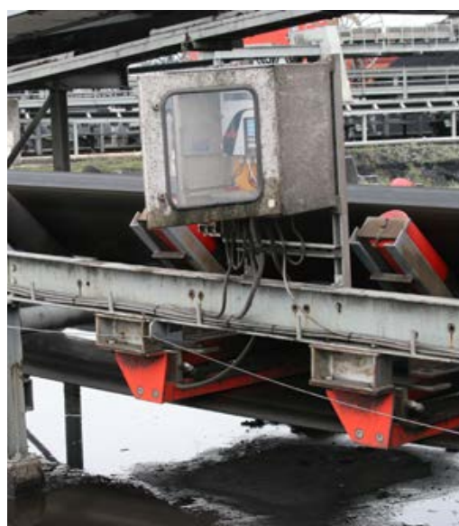
Siemens Milltronics MMI trade-approved belt scale measures incoming coal with an accuracy of 0.25%.