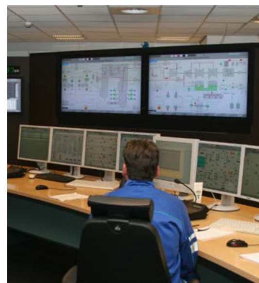
With Siemens SIMATIC S-7 control system, technicians monitor the entire power generation process from the comfort of the control room.