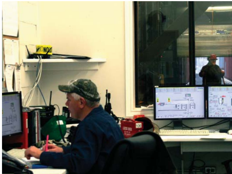
All instruments are linked via a Profibus network, feeding directly into the SIMATIC PCS 7 system for convenient monitoring in the control room.

Written two decades ago, these words echo the drive behind the sustainability initiatives currently in place at Kawartha Ethanol. If anything, the need for greener practices in industry has only increased these past two decades, and will not soon disappear. Siemens process instruments play an important role in helping companies