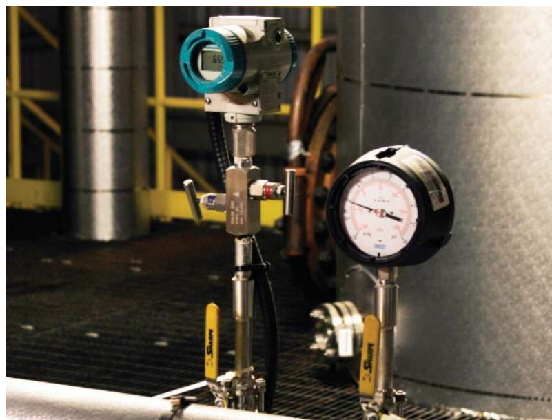
SITRANS P pressure transmitters are mounted on pipes to monitor steam in the plant.