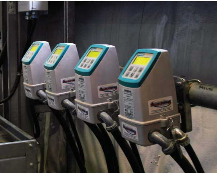
Dozens of Siemens flowmeters measure water, chemical dosing, and material flow throughout the ethanol production.