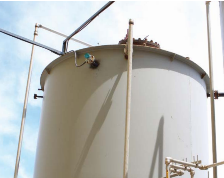
SITRANS LVL200 vibrating point level switches give reliable backup overflow protection on Kawartha Ethanol's chemical dosing tanks.

nity. Are there any sustainable business practices happening in your village, town, or city? For many people, the answer is a resounding yes!