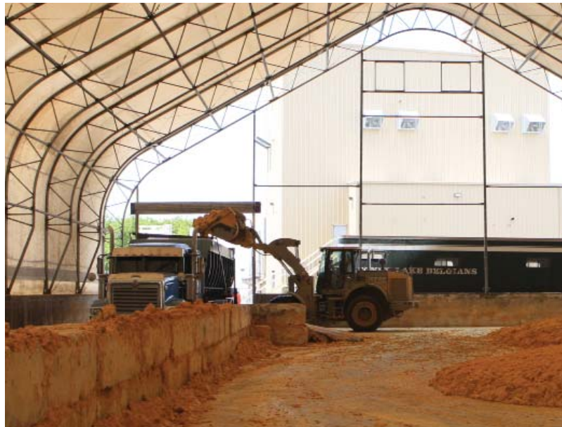
Workers load waiting trucks with distillers grains, a solid material co-product from the ethanol production process, destined for cattle feed.

So how do Kawartha Ethanol's production processes contribute to a greener globe? These processes primarily involve three areas: reduction in water usage, heat