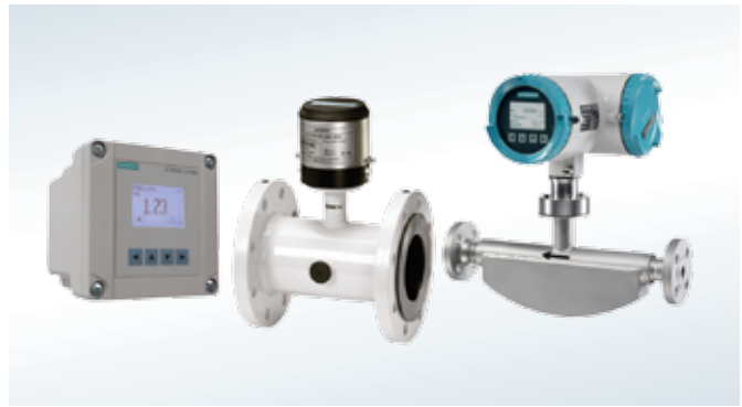
SITRANS LUT400 ultrasonic controller. SITRANS MAG 8000 flow meter and the FC Coriolis flow meter.

The SITRANS LUT400 controller line includes pump control parameters that can be set to minimize pumping activity during on-peak pricing. The LUT400 will pump the well down to the low set point during off-peak pricing, allowing for the well to completely fill when energy is at a premium. During the peak pricing periods, the controller will maintain a high