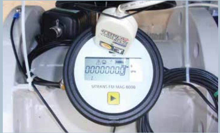
An infrared IrDA interface offers the ability to upload or download data via laptop.

Subject to change without prior notice Order No.: PIFL-00079-0719 All rights reserved ©2018 Siemens Industry, Inc.