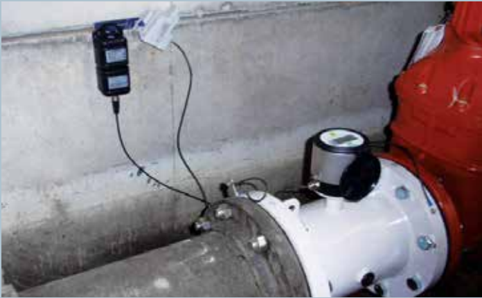
The MAG 8000 is flexible enough for installation virtually anywhere, including district water lines.