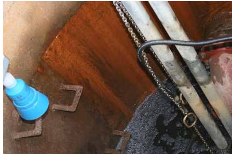
Figure 1: During peak periods, the pump operating range is much smaller than in normal operation, reducing the amount of time pumps must run.