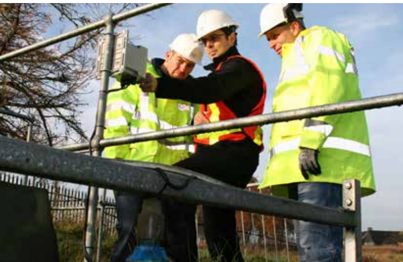
Setting up an economy-pumping regime and performing infiltration and ingress monitoring is simple and can cut your company's energy costs dramatically.