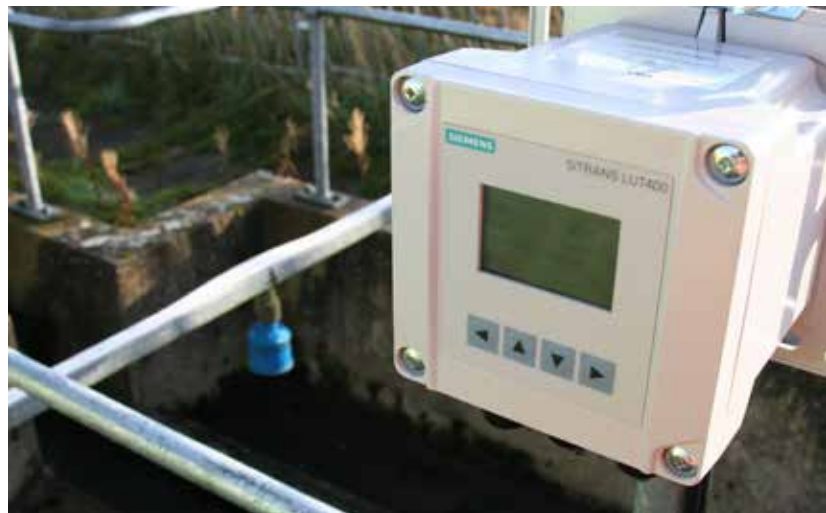
LUT400 controller and XRS-5 transducer in a wet well application.

To use this feature, provide the known volume in the well between the pump's ON and OFF setpoints. The controller will calculate the pumped volume based on the rate of level change in the well during pumping. It also calculates the inflow rate based on the rate of level change in the well just prior to pump startup.