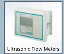
Ultrasonic Flow Meters