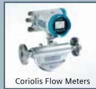
Coriolis Flow Meters