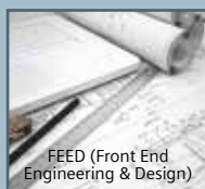
FEED (Front End Engineering & Design)