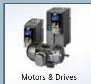
Motors & Drives