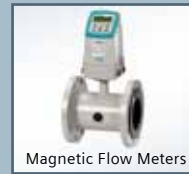
Magnetic Flow Meters