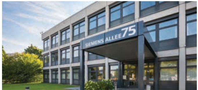
Karlsruhe, Germany Analytical Products and Solutions

Before shipping an analyzer to the local facility, the analyzer can be inspected and approved for shipment. Inspection scope may be the familiar electronic data package, done via remote internet access to the analyzers or in person on site. Furthermore, the analyzer can be subject to a formal factory acceptance test after shipping it to the local facility.