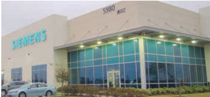
Houston, Texas, USA Analytical Products and Solutions

Although each manufacturing location focuses primarily on their respective hemispheres, there is frequently manufacturing capacity available which can be utilized globally.