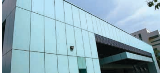
Singapore Analytical Products and Solutions

Although the actual analyzers may be completed globally, they are shipped to the local facility to be combined with the associated locally manufactured sample systems, network components, system integration or any other accessories for that specific project prior to releasing it for shipment to the customer site.