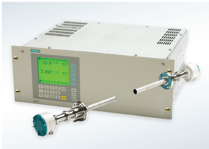
Siemens LDS6 Analyzer

The analytical solution for interference free O 2 measurement in flares is the Siemens Insitu Tunable Diode Laser (TDL). The TDL is not affected by varying hydrocarbons in the flare feed stream. The analyzer has no moving parts and the sensors are intrinsically safe for Class 1, Division 2 installations. Since the LDS 6 is an insitu type analyzer it has no sample system, reducing initial capital cost and long term cost of ownership due to extremely low maintenance.