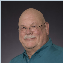
Bruce Slade Mosaic