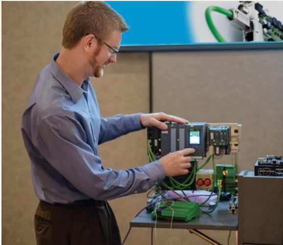
Hands-on examples are the best way to learn about the real world of PROFINET industrial networks.

Of course, once you make those decisions, you still have to create the actual product. We help guide you through each step of your PROFINET system design, from creating an application interface for end users to verifying your PROFINET network interface implementation. Along the way, we cover a host of subjects, ranging from interpreting specification documents to how most PROFINET network stacks operate.