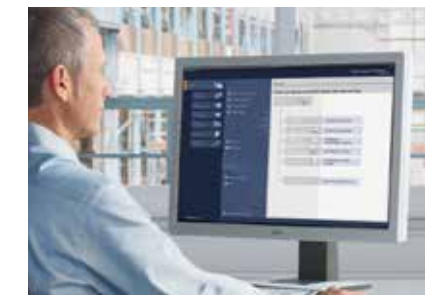
Intuitive, efficient, proven – The TIA Portal redefines engineering