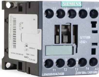
Lighting Contactor Class LE Electrically Held 20 Amp, 4 Pole