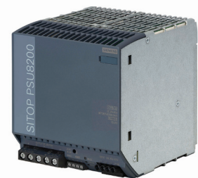
SITOP PSU 8200