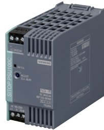
SITOP PSU 100C