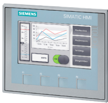
KTP 400 Basic