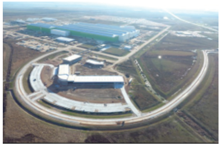
Tenaris BayCity seamless pipe plant sits on 1,500 acres and covers 1.2 million square feet. It is the world's largest automation implementation using the Siemens TIA Portal to program and manage nearly 50,000 IO points across 4,000 network nodes.

"While Tenaris is one of the world's largest suppliers to the energy industry, we're also 100 percent committed to conserving our use of energy," he says. "Beyond the cost savings, it's the right thing to do for our environment and our future. Given the plant's size and complexity, energy conservation was a big design challenge for us."