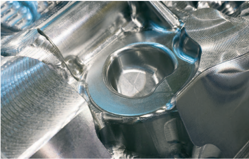
Intelligent motion control with Advanced Surface produces perfect surfaces at high machining rates and maximum contour accuracy