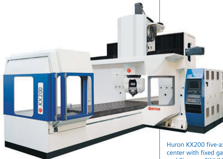
Huron KX200 five-axis machining center with fixed gantry, moving table and Siemens SINUMERIK 840D CNC with dedicated post-processor.

Above: Thin wall and deep pocket sections of aerospace parts are handled easily, with speed and accuracy unavailable in previous generation machines.