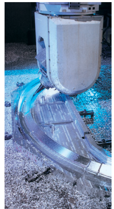
Siemens Sinumerik 840D with TRAORI (Transformation Orientation)

Through TRAORI transformation orientation, the actual position of the workpiece determines the cutting sequence. Plus, with the introduction of COMPCAD, a Siemens aerospace application-specific software, the machine control's compressor function is