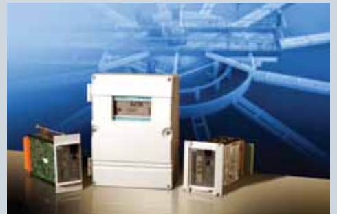
Siemens SITRANS LUC500 (formerly the EnviroRanger) level controller

Over the next 6 years, the collection system process was refined to improve the dollars that were being billed by the power company for each lift station. Lumberton changed to monitoring the actual kWh (kilowatt hours) used in 2002. This gave them a more precise cost comparison, because the cost per kWh can fluctuate throughout the year. The plant