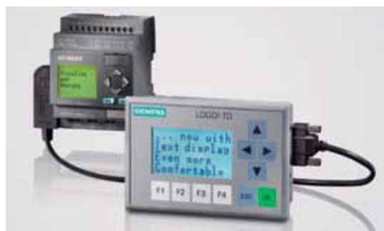
Siemens LOGO! programmable relay controller

Using the Siemens LOGO! (programmable relay controller), in conjunction with the LUC500 controller, results in the ultimate (discrete inputs) control. With this system in place, they can take pumps out of service based on efficiency.